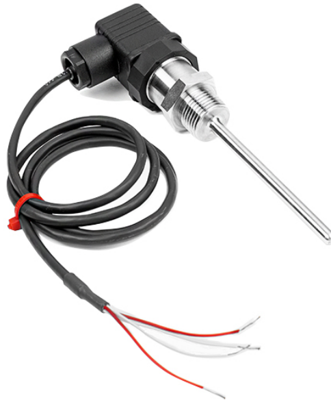
'HIRSCHMANN PT100 PROBE ASSEMBLY'