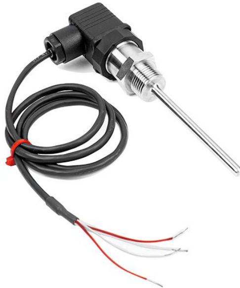
'HIRSCHMANN PT100 PROBE ASSEMBLY'