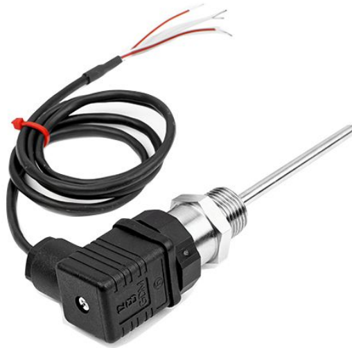
'HIRSCHMANN PT100 PROBE ASSEMBLY'