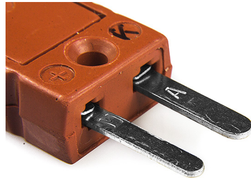
Miniature Hi-Temp Plastic in-line Plug - HTP (dimensions in mm)

Labfacility are the UK's leading manufacturer of Temperature Sensors, Thermocouple Connectors and associated Temperature Instrumentation and stockings of Thermocouple Cables. The Company has been trading since 1971 and is ISO9001 accredited.