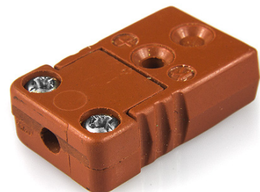
Miniature Hi-Temp Plastic in-line Socket - HTP