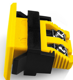
Miniature Fascia Socket (with nylon mounting clip) (dimensions in mm)

Labfacility are the UK's leading manufacturer of Temperature Sensors, Thermocouple Connectors and associated Temperature Instrumentation and stockings of Thermocouple Cables. The Company has been trading since 1971 and is ISO9001 accredited.