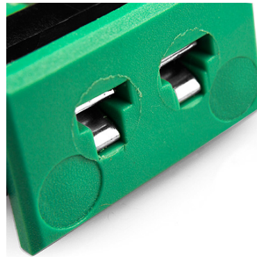
Miniature Fascia Socket (with nylon mounting clip) (dimensions in mm)

Labfacility are the UK's leading manufacturer of Temperature Sensors, Thermocouple Connectors and associated Temperature Instrumentation and stockings of Thermocouple Cables. The Company has been trading since 1971 and is ISO9001 accredited.