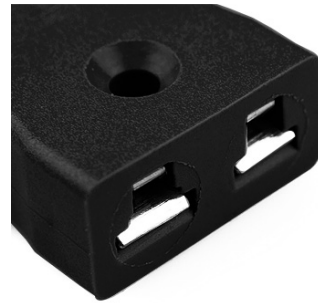
Miniature PCB Socket (dimensions in mm)

Labfacility are the UK's leading manufacturer of Temperature Sensors, Thermocouple Connectors and associated Temperature Instrumentation and stockings of Thermocouple Cables. The Company has been trading since 1971 and is ISO9001 accredited.