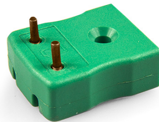
Miniature PCB Socket (dimensions in mm)

Labfacility are the UK's leading manufacturer of Temperature Sensors, Thermocouple Connectors and associated Temperature Instrumentation and stockings of Thermocouple Cables. The Company has been trading since 1971 and is ISO9001 accredited.