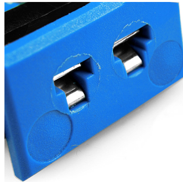
Miniature Fascia Socket (with nylon mounting clip) (dimensions in mm)

Labfacility are the UK's leading manufacturer of Temperature Sensors, Thermocouple Connectors and associated Temperature Instrumentation and stockings of Thermocouple Cables. The Company has been trading since 1971 and is ISO9001 accredited.