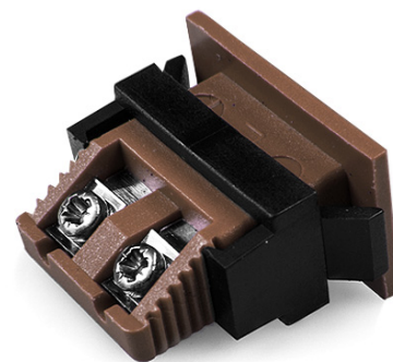
Miniature Fascia Socket (with nylon mounting clip) (dimensions in mm)

Labfacility are the UK's leading manufacturer of Temperature Sensors, Thermocouple Connectors and associated Temperature Instrumentation and stockings of Thermocouple Cables. The Company has been trading since 1971 and is ISO9001 accredited.