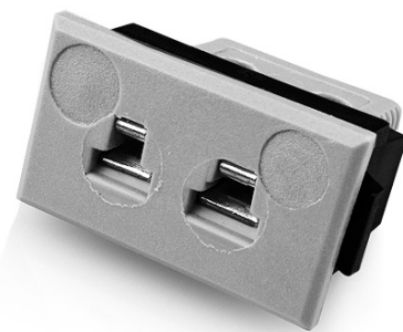
Miniature Fascia Socket (with nylon mounting clip) (dimensions in mm)

Labfacility are the UK's leading manufacturer of Temperature Sensors, Thermocouple Connectors and associated Temperature Instrumentation and stockings of Thermocouple Cables. The Company has been trading since 1971 and is ISO9001 accredited.