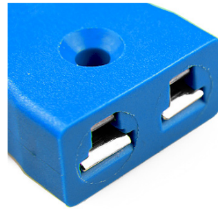
Miniature PCB Socket (dimensions in mm)

Labfacility are the UK's leading manufacturer of Temperature Sensors, Thermocouple Connectors and associated Temperature Instrumentation and stockings of Thermocouple Cables. The Company has been trading since 1971 and is ISO9001 accredited.